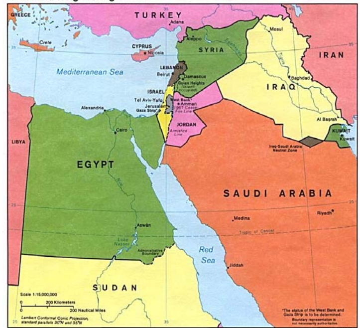
Israel and Neighboring States

http://www.lib.utexas.edu/maps/middle_east_and_asia/israel_nbr90.jpg